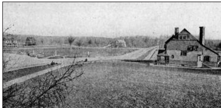
Rochelle Park's suburban layout was established in 1885, and each home was designed and constructed as the lots were purchased. "The Lawn" looking east.

You can't help but feel as though you have stepped back in time when you stroll the tree-lined streets of the Rochelle Park and Rochelle Heights neighborhoods. Many rambling homes with Victorian detail, an abundance of public open space, and wide boulevards with expansive front lawns render a quiet atmosphere reminiscent of a bygone era. That's just what was planned for this community when it was conceived over 100 years ago.