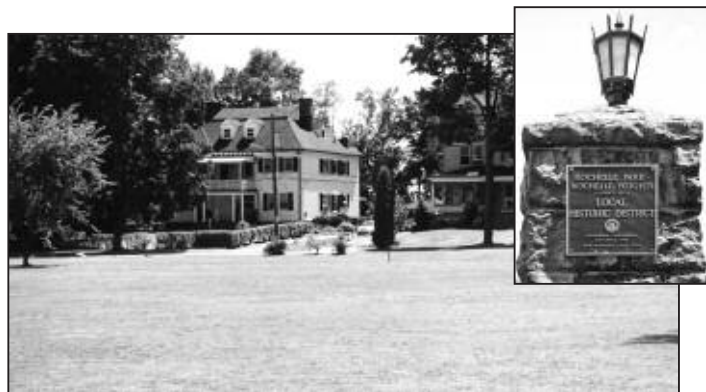
"The Lawn" today, looking south.