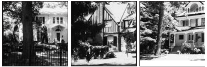
Various styles of historic architecture found in Rochelle Park and Rochelle Heights.

The neighborhoods contain more than 275 examples of residential architecture that were popular from the 1890’s through the 1920’s.