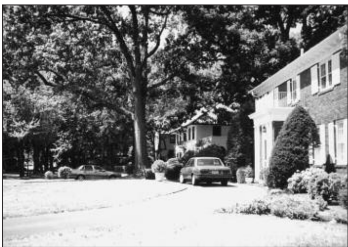
A tree-lined street in Rochelle Heights shows the wide front lawns and large homes that were envisioned for the community over 100 years ago.

Barrett tailored the terrain with formality and aesthetic grace. Streets were carved in such a way that the neighborhood evoked a bucolic, yet manorial atmosphere. With far-sighted liberality, a total of nearly six acres was set aside for open grassy spaces suitable for outdoor gatherings. The meadow-like circle named "The Lawn" was connected to the elongated oval green of "The Court" by a wide and arbored street dubbed "The Boulevard". The neighborhood was designed as a "commuter suburb" with a diagonal orientation of The Boulevard toward the railroad station. Barrett gave curves and pleasing irregularity by snaking "The Serpentine" through the neighborhood. Stone pillars designed by English architect E.A. Sargent were erected to mark the Park's entrance.