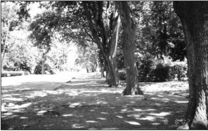
A long view down “The Boulevard” in Rochelle Park, showing the wide front lawns unencumbered by fences and gates.