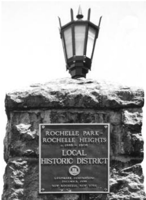
Stone pillars were designed to mark the entrances to both neighborhoods. Bronze plaques were erected in 1986 to announce the entrance to the local historic district.

P erhaps you're planning on buying a house in the Rochelle Park-Rochelle Heights Local Historic District. Maybe you already own one, but you don't know how the historic district affects your house and property. Someone told you that if you own a house in this neighborhood, you have to get permission to make any exterior changes, even to paint or plant tulips. You're asking "What kinds of changes can I really make?" If you're confused, you're not alone. This brochure was designed to help you sort out a lot of information and tell you how to get more information if you need it.